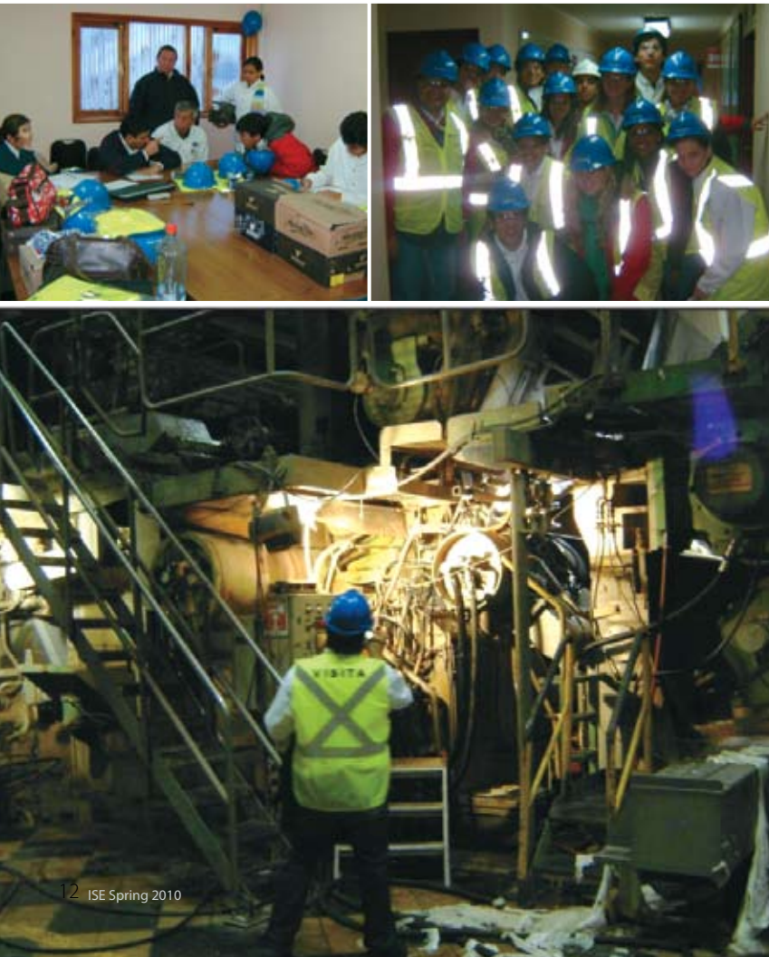
ISE students participating in the International Energy Management course in the summer of 2009, performing an energy audit at a paper mill in Concepcion, Chile, operated by the Norwegian firm Norske Skog.