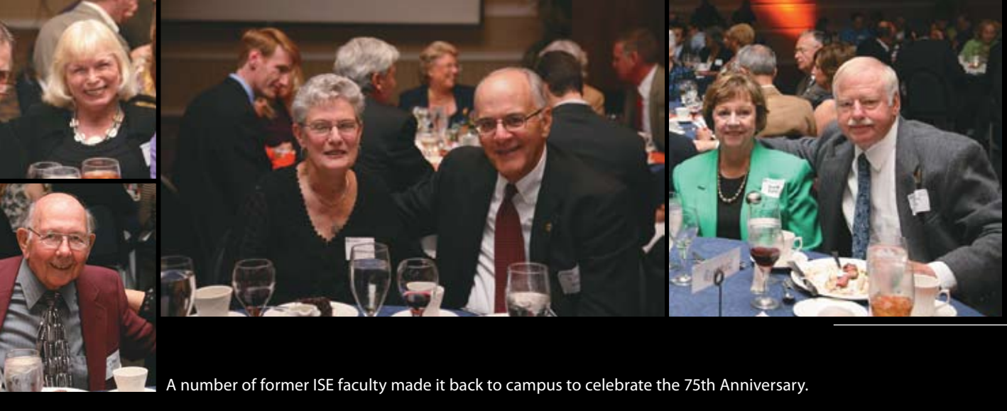
A number of former ISE faculty made it back to campus to celebrate the 75th Anniversary.