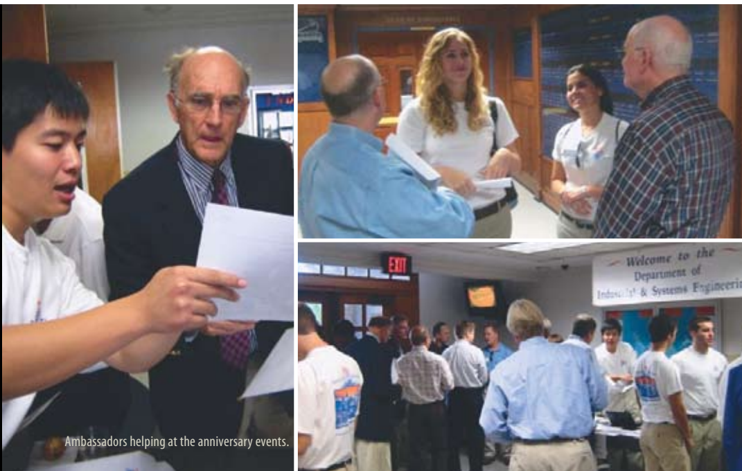
Ambassadors helping at the anniversary events.

matching T-shirts and smiling faces. These students have formed a new group called the ISE Ambassadors.